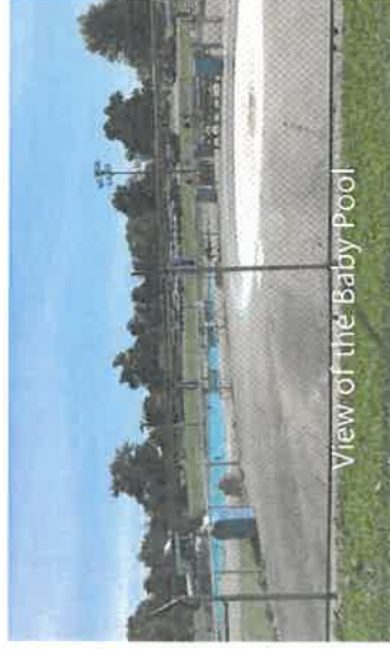
View of the Baby Pool